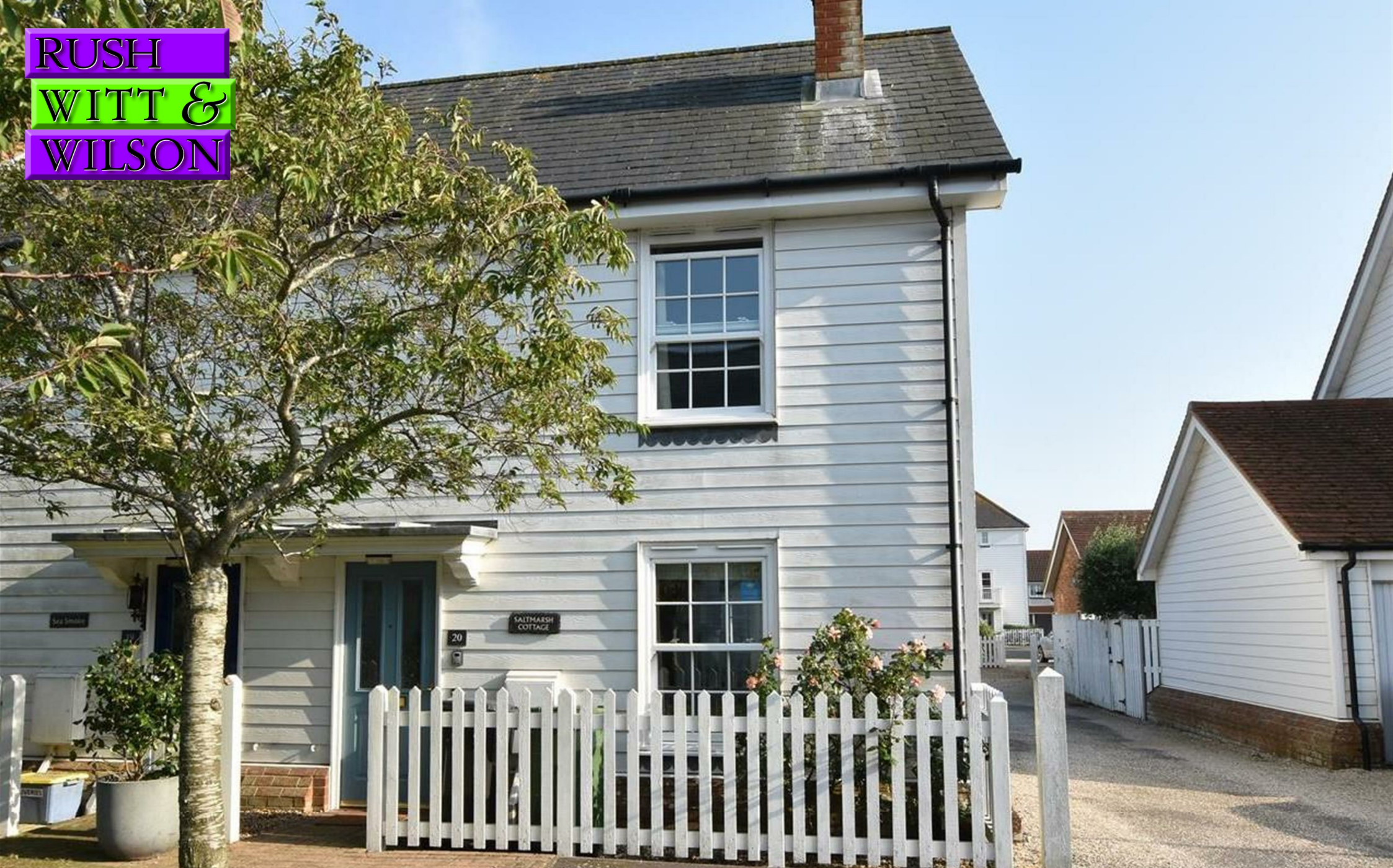
Saltmarsh Cottage, 20 Whitesand Drive, Camber, East Sussex TN31 7SJ Guide Price £289,950